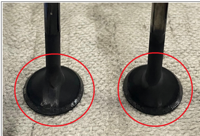
Auslassventilsitz stark verkohlt.png