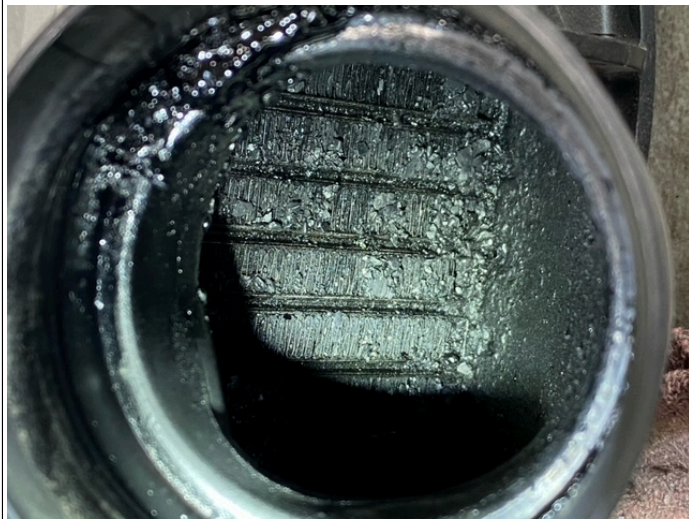
Charge Air Pipe.png