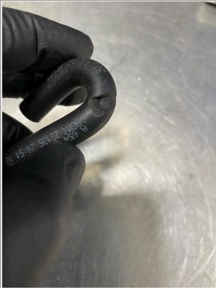
Inlet Side Of Charge Air Cooler.jpeg