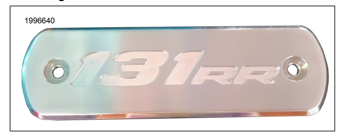
Figure 2. Unpainted Accents Part No. 25702011A